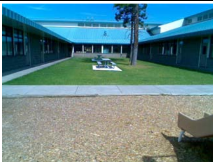
S Plan Irregularity Primary