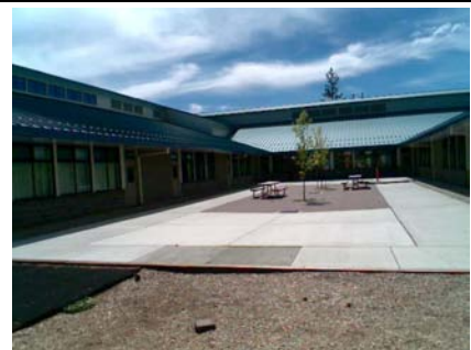
N Vertical Irregularity Primary