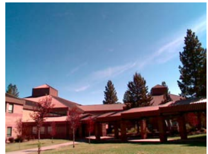
S Tertiary Structural Type