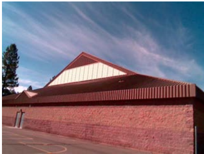
E Plan Irregularity Secondary