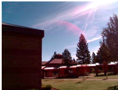
S Vertical Irregularity Primary