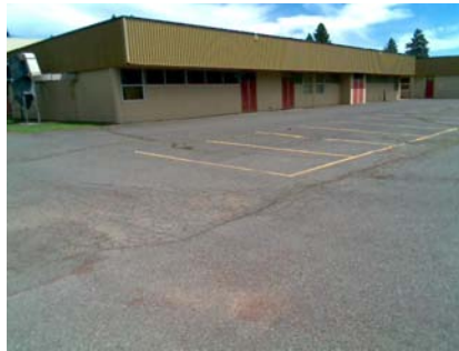
SE General Site