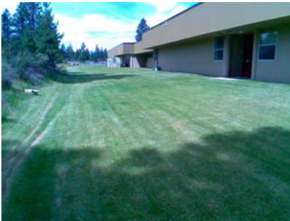
NE Plan Irregularity Primary