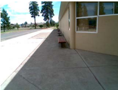
NW Primary Structural Type