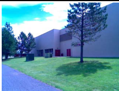
NW Plan Irregularity Primary