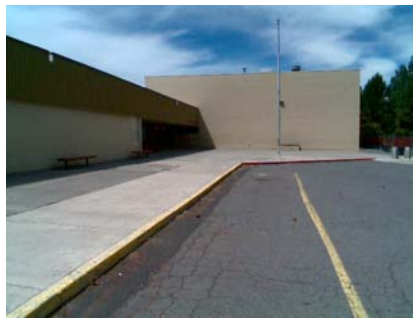
NW Vertical Irregularity Primary