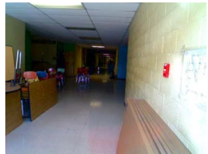
N Primary Structural Type