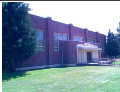
NE Plan Irregularity Primary