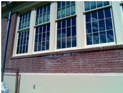
W Poor Condition