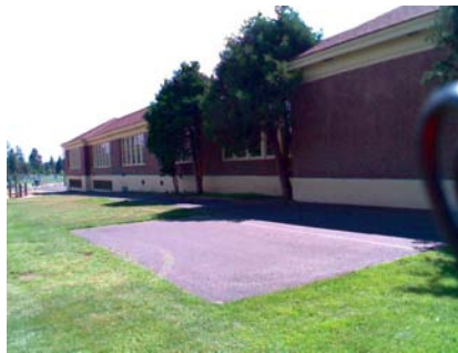
NE Vertical Irregularity Primary