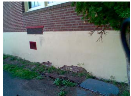
E Primary Structural Type