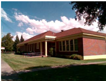
NW General Site