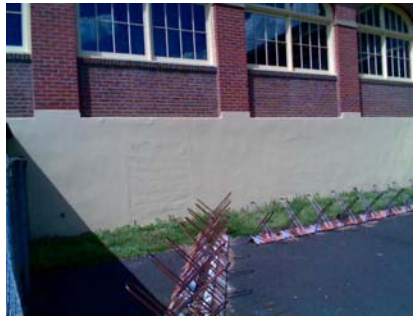
S Seismic Upgrade