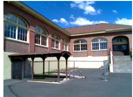
SE Plan Irregularity Primary