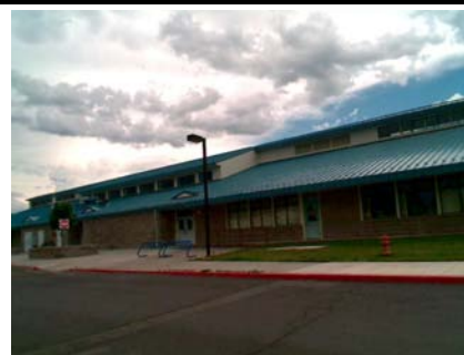
W Number of Stories