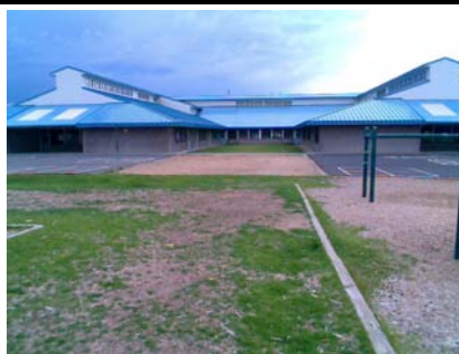
S Plan Irregularity Primary -vert irregularity