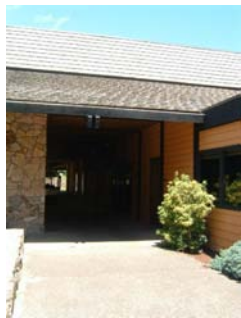
S General Site