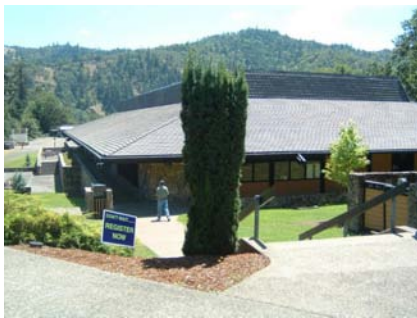
S General Site