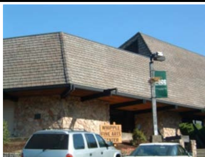
S Vertical Irregularity Tertiary