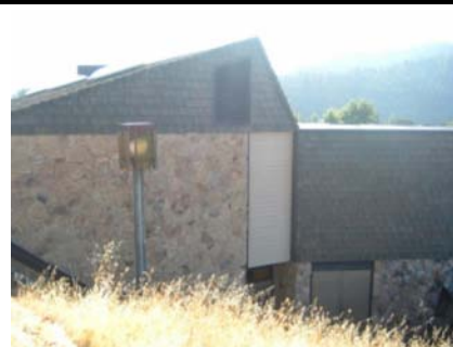
W Vertical Irregularity Tertiary