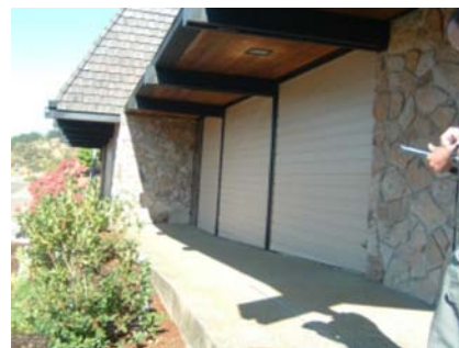
SE Plan Irregularity Tertiary