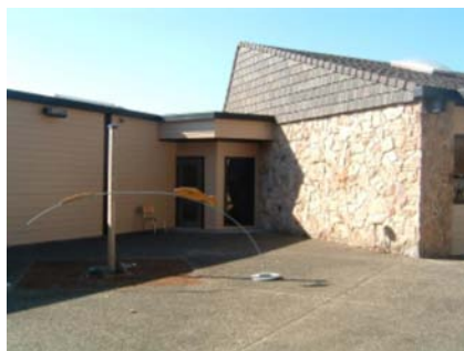
NE Plan Irregularity Primary non-parallel system as well