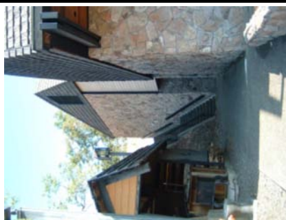
SW Vertical Irregularity Primary