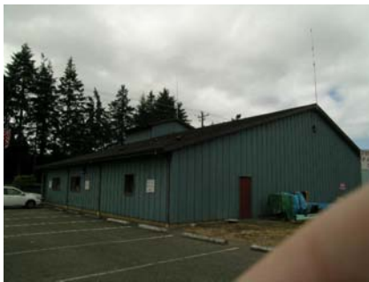
NE Primary Structural Type