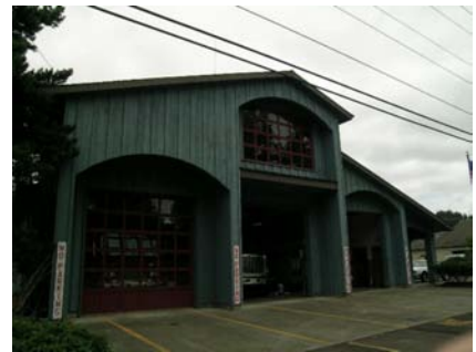
S Plan Irregularity Primary and # of stories