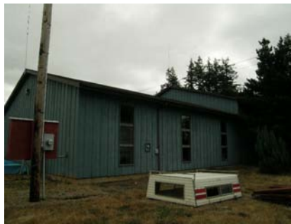
NW Vertical Irregularity Primary