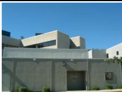
S Vertical Irregularity Secondary reentrant corners also older portion is at center/top