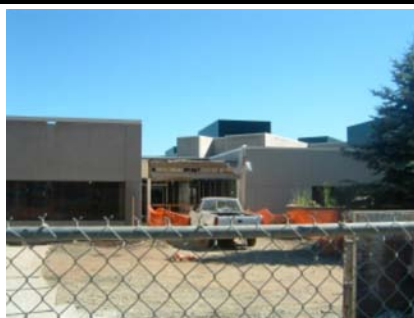
N General Site construction of newest portion with older hospital in the rear