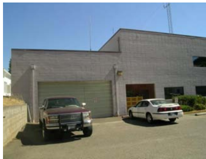
W Vertical Irregularity Primary (both primary and secondary structural system)