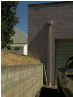
W Vertical Irregularity Secondary