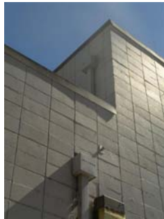
W Falling Hazard parapet