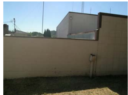
N Vertical Irregularity Primary