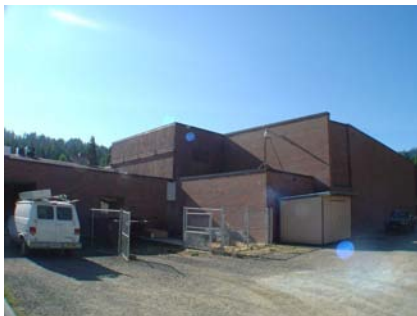
W Vertical Irregularity Primary