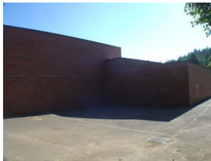
SW Plan Irregularity Primary