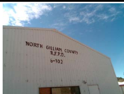
E Building Name