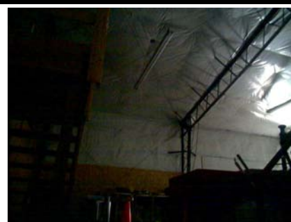
N Primary Structural Type