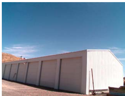
NW Elevation View