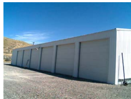
NW Plan Irregularity Primary