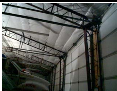
S Primary Structural Type