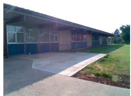
N Elevation View W WING