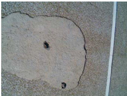
W Primary Structural Type