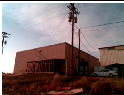
SE Elevation View