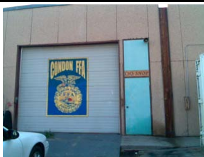
E Building Name