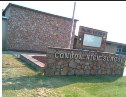
N Building Name