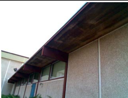
NE Primary Structural Type