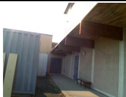
E General Site CONN TO A