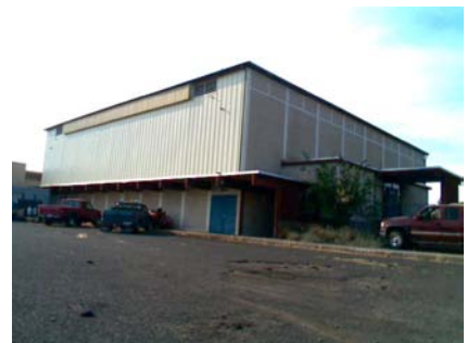
SE Elevation View