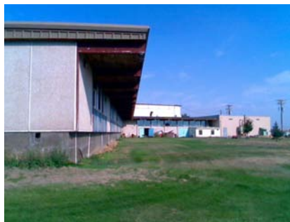
W Vertical Irregularity Secondary