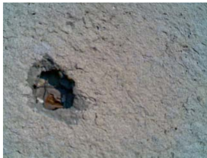
W Primary Structural Type WOOD SIDING BENEATH STUCCO