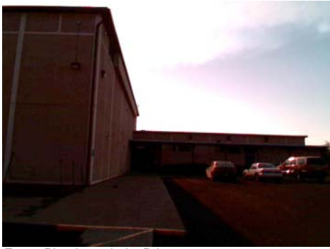
E Plan Irregularity Primary