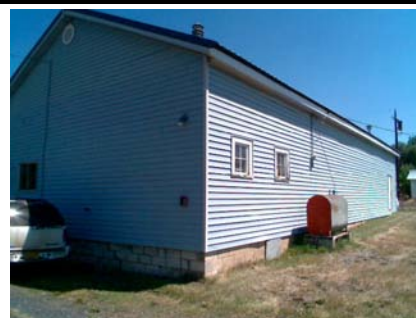
S Elevation View