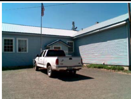
NE Plan Irregularity Primary