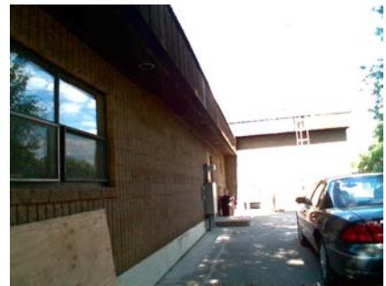
W Plan Irregularity Primary