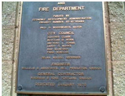
W Field Verified Year Built