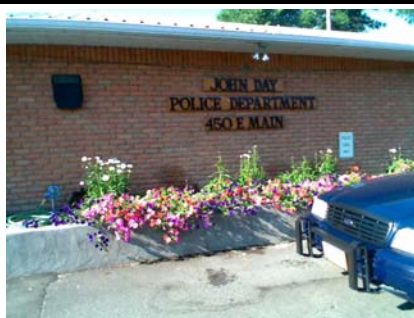
S Building Name