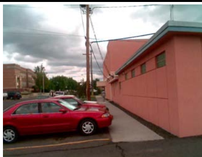
W Elevation View inmate