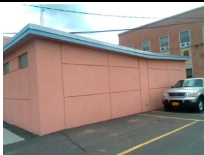
S Elevation View