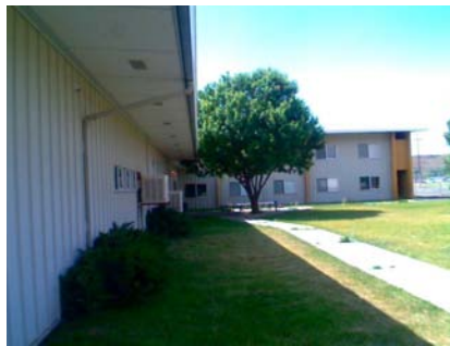
N Elevation View