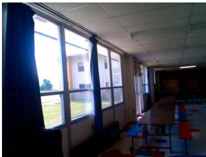
E Primary Structural Type