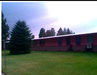
E Elevation View