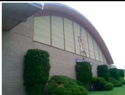
E Elevation View