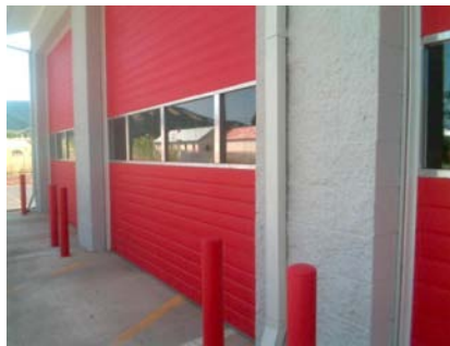
N Primary Structural Type