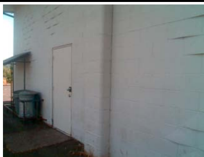
N Primary Structural Type