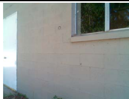
N Primary Structural Type