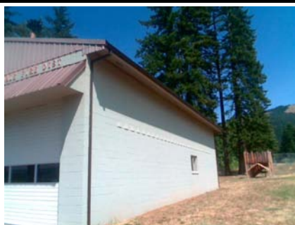
S Elevation View