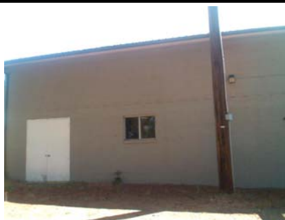
N Elevation View