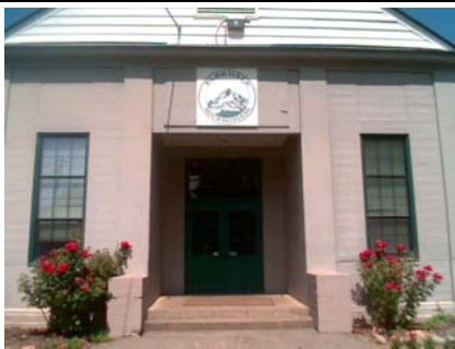
S Primary Structural Type