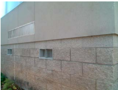
N Primary Structural Type