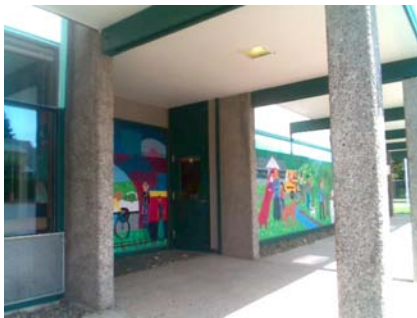
S Primary Structural Type