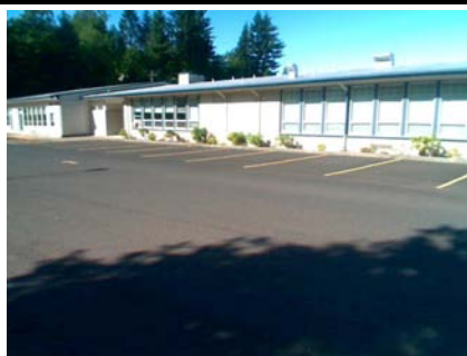
S Elevation View