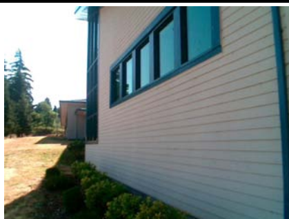
NE Elevation View