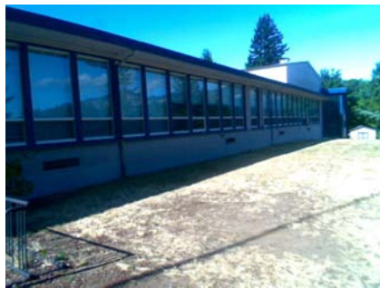
E Elevation View