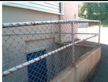
N General Site sloped site