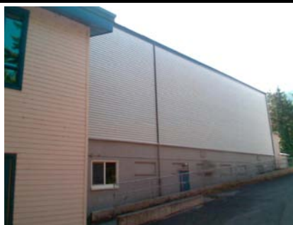
N Elevation View