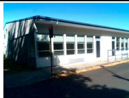
SW General Site