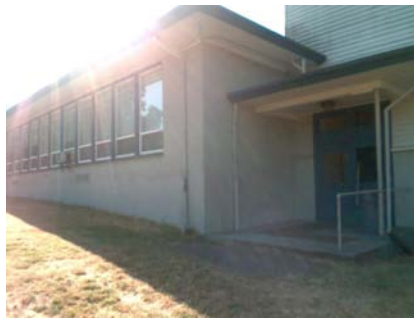
N Basement sloped site