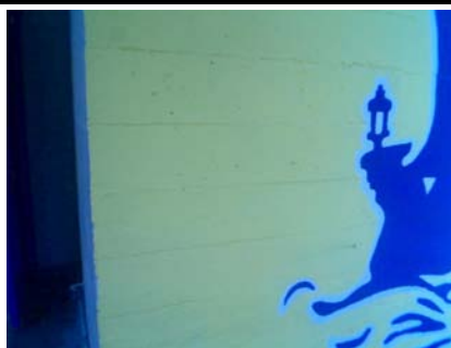
S Primary Structural Type