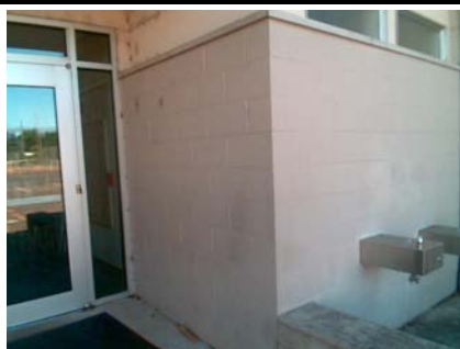
NE Primary Structural Type