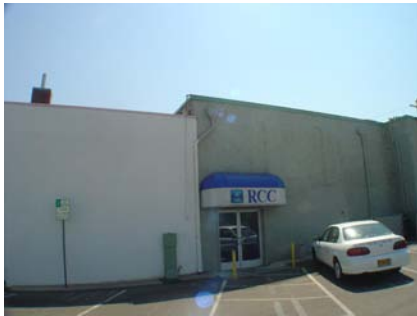
N Vertical Irregularity Primary