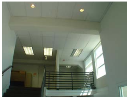
S Primary Structural Type