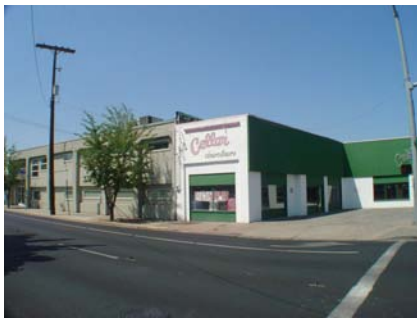
SW General Site