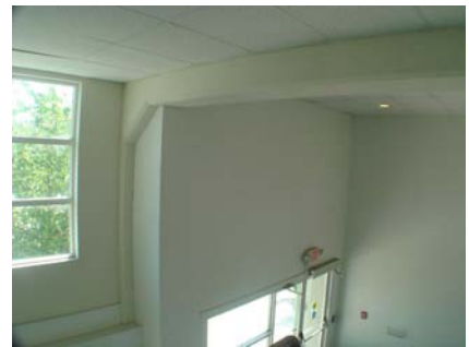
S Primary Structural Type