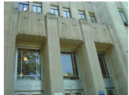
E Falling Hazard