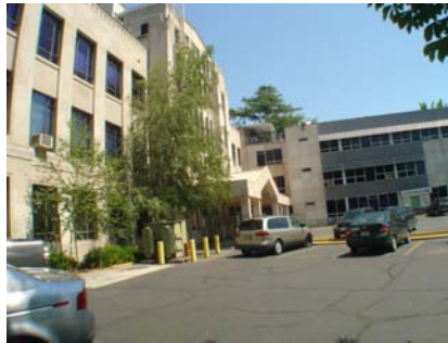
W Plan Irregularity Primary Plan Irregularity to the new addition can be seen to the right of the picture.