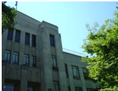
E Vertical Irregularity Primary