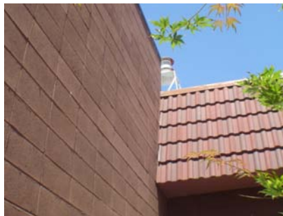
S Vertical Irregularity Primary