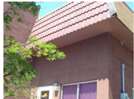
S Falling Hazard