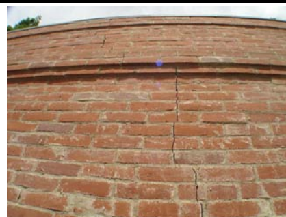
S Poor Condition