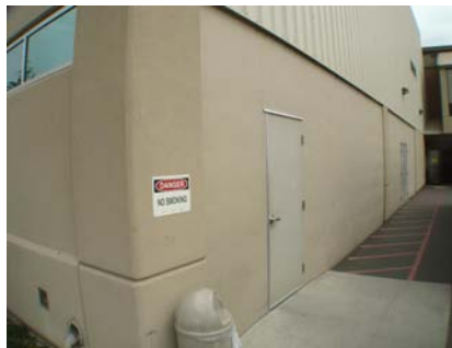
SE Primary Structural Type Shear wall underneath light metal.