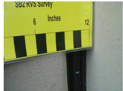
NE Pounding Potential