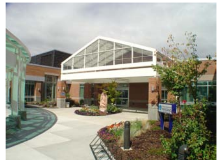
E Falling Hazard

This metal overhead ornamental piece is not connected to the building.