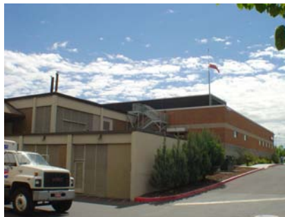
S Plan Irregularity Primary Also shows vertical a irregularity.