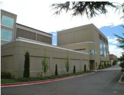
SW Vertical Irregularity Primary