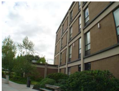
SW Vertical Irregularity Primary