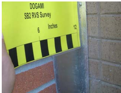
E Pounding Potential