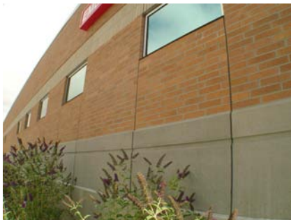
SE General Site

This metal overhead ornamental piece is not connected to the building.