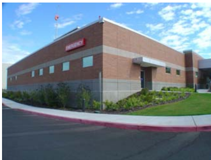
SE Elevation View