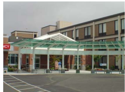
E Vertical Irregularity Primary