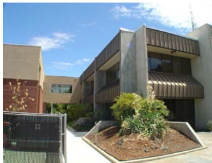
NW Other Light 2nd story connection to newer building (city hall).