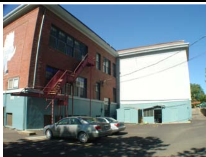
E Plan Irregularity Primary