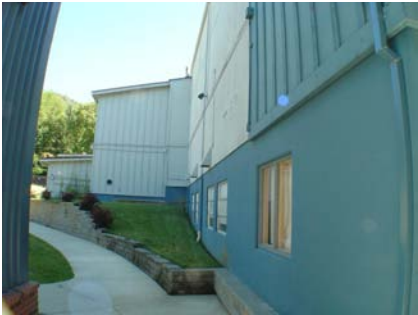
SW Plan Irregularity Primary also shows sloped site.