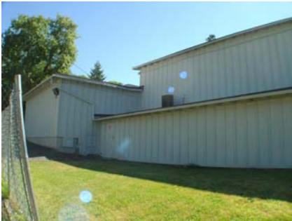
W Vertical Irregularity Primary also shows reentrant corner.