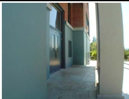
S Plan Irregularity Secondary