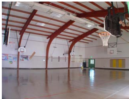
S Primary Structural Type