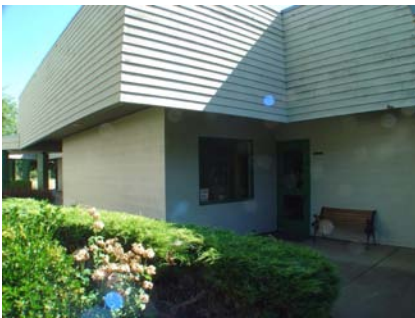
W Plan Irregularity Primary Minor reentrant corner.