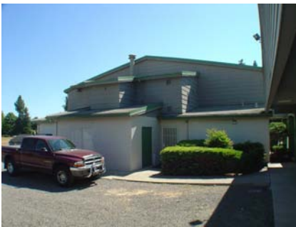
SW Vertical Irregularity Primary also shows plan irregularity.