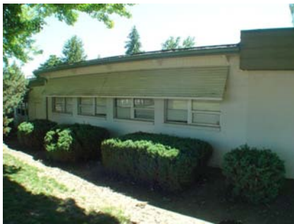
W General Site Masonry wall, vertical irregularity can also be seen.