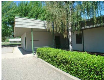
SE Plan Irregularity Primary