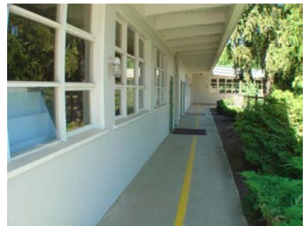
E Plan Irregularity Primary