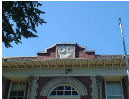
S Falling Hazard