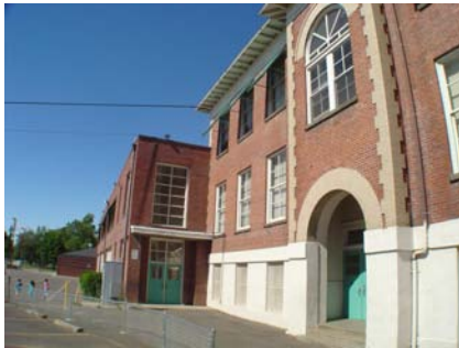
W Plan Irregularity Tertiary The building on the left is a new addition.