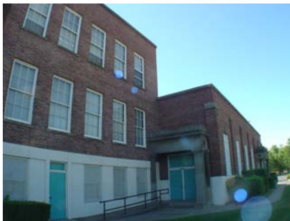
E Vertical Irregularity Primary also shows reentrant corner.