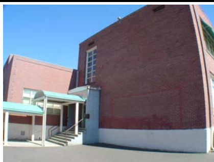
W Vertical Irregularity Primary With "C"