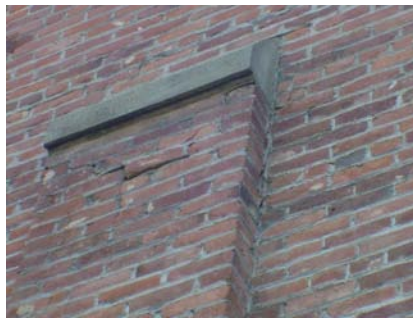
E Poor Condition Cracks and poor masonry