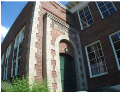
N Falling Hazard