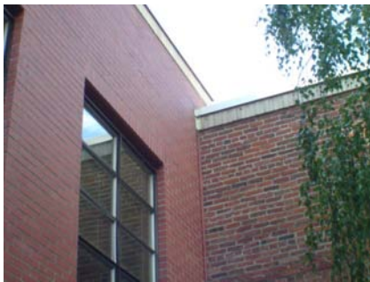
E Vertical Irregularity Primary To building "A". Also shows a reentrant corner.