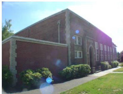
NE Vertical Irregularity Primary