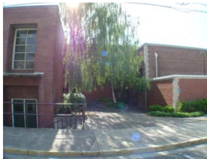
E Vertical Irregularity Primary