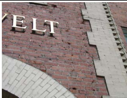
W Poor Condition