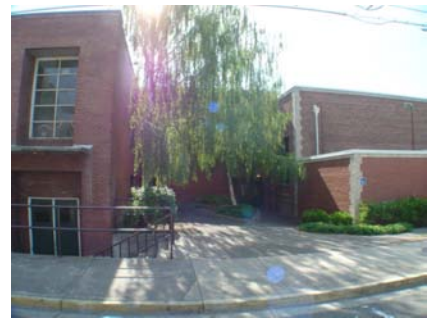
E Vertical Irregularity Primary