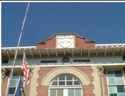
W Falling Hazard