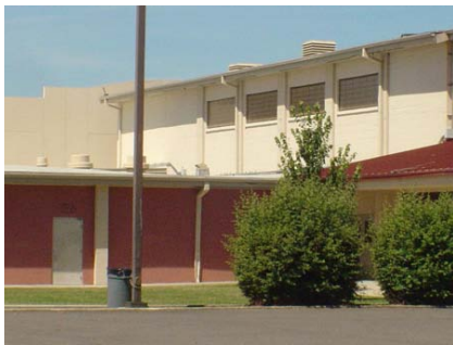
SW Vertical Irregularity Primary