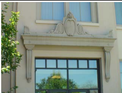
E Falling Hazard