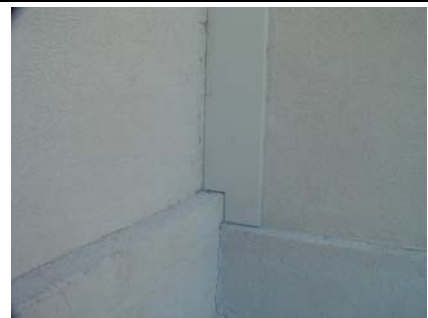
SE Other wood joint to "D".