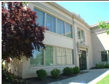
SE Elevation View