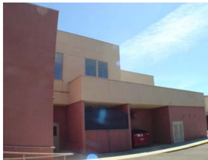
NE Vertical Irregularity Primary