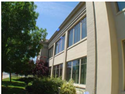
S Primary Structural Type