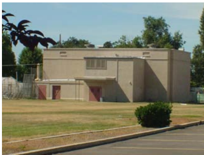
SE Elevation View