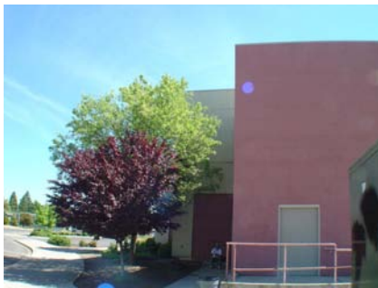
NE Plan Irregularity Primary