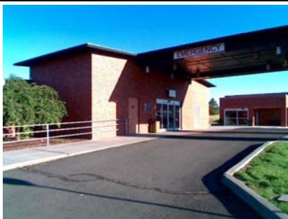
SE General Site