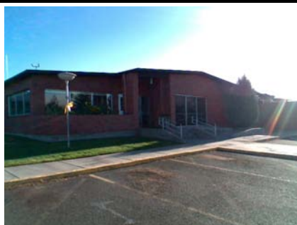
S Elevation View