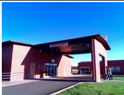
SE Falling Hazard