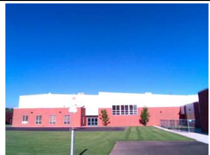
E Elevation View 2000 addition