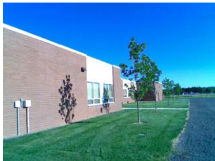
SE Elevation View note age of trees