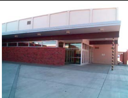
W Elevation View