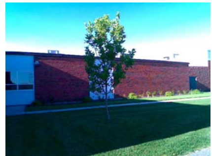
N Elevation View