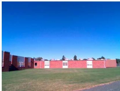
E Elevation View Formally speaking possibility of this being an addition but there is no material indication