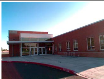
SW Elevation View 2000 addition