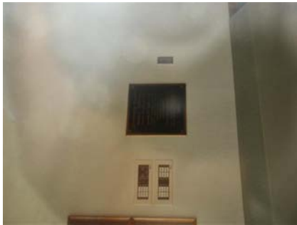
S General Site