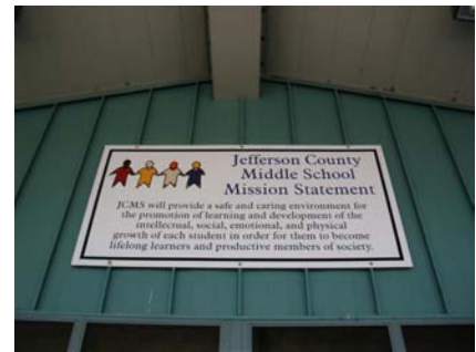
S General Site