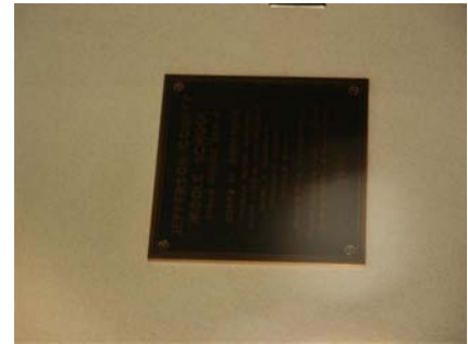
S General Site