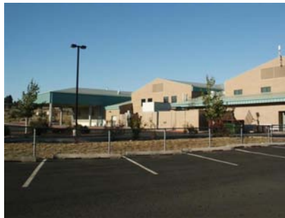
S General Site