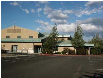
S General Site