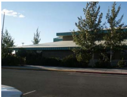
S General Site