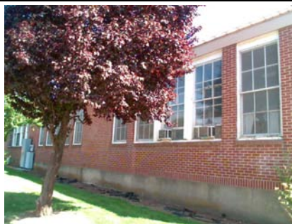
N Elevation View