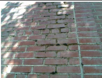
W Poor Condition