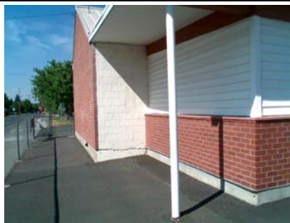
S Primary Structural Type