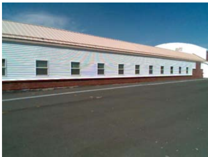
S Elevation View