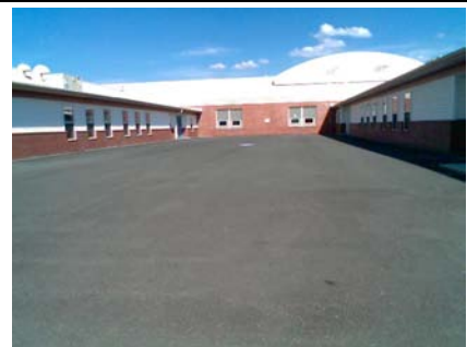
W Elevation View inside the 'u'