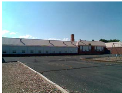
E Falling Hazard