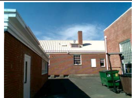
S Falling Hazard