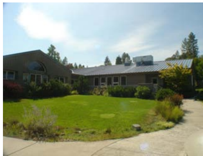
E Plan Irregularity Primary