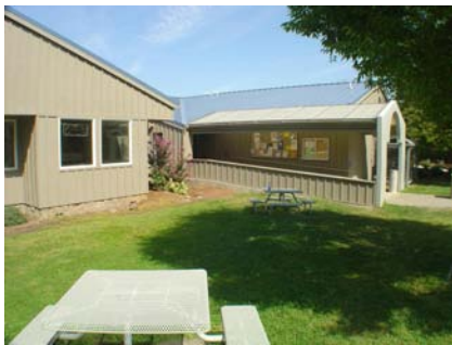
S Plan Irregularity Primary