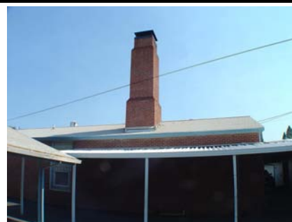
S Falling Hazard