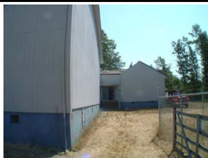
W Plan Irregularity Primary