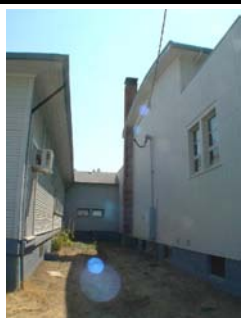
W Falling Hazard