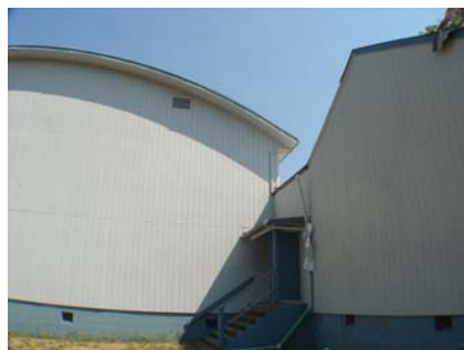
S Vertical Irregularity Primary