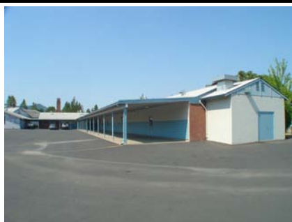
NE Plan Irregularity Primary