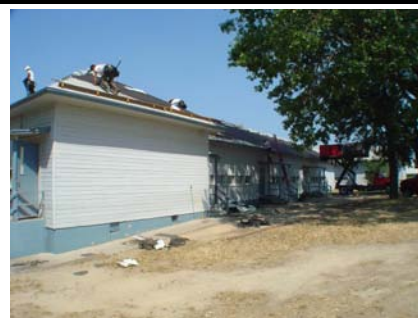
E General Site New roof.