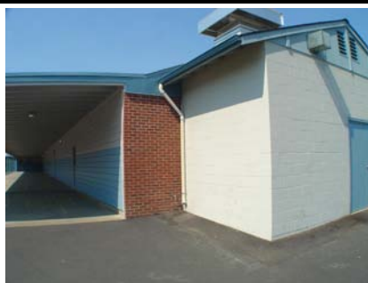
NE Plan Irregularity Secondary Secondary structural type can also be seen.