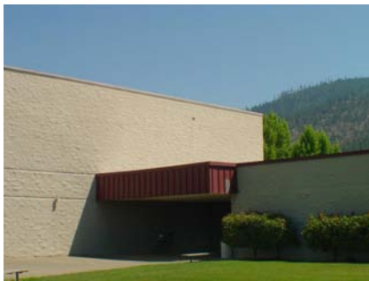
W Vertical Irregularity Primary