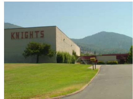
W Plan Irregularity Primary