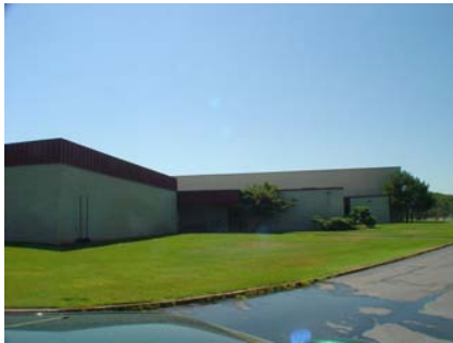
N General Site