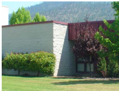
W Plan Irregularity Secondary