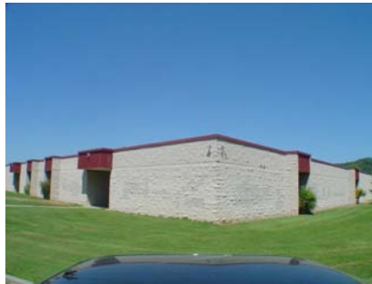
SE General Site