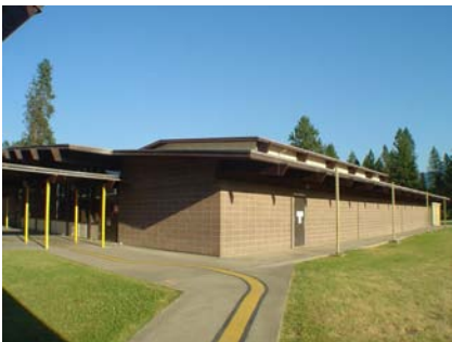
NW Primary Structural Type