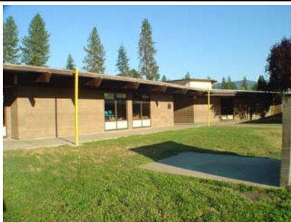
W Plan Irregularity Secondary