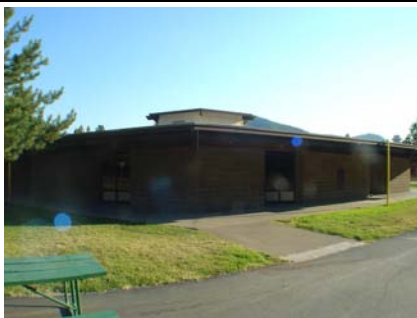
W General Site