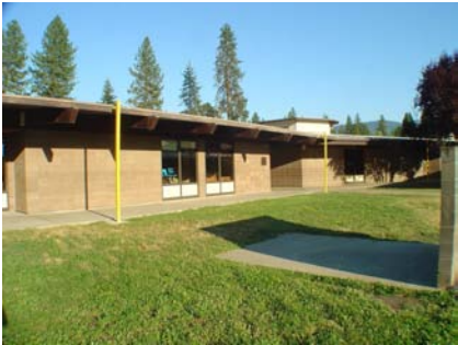
W Plan Irregularity Primary