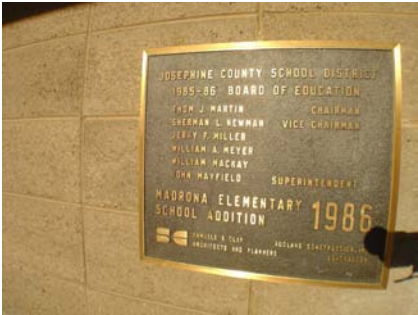
W Field Verified Year Built