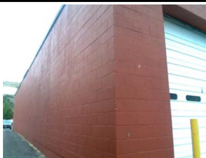
N Primary Structural Type