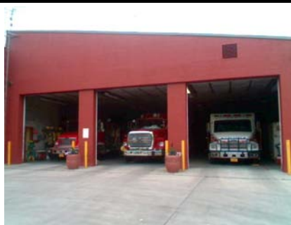
E Plan Irregularity Primary