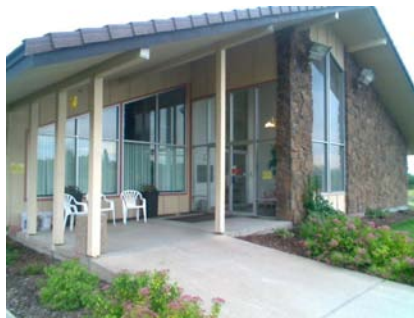
N Primary Structural Type wood post and beams