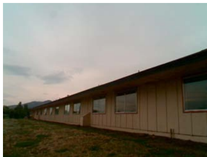
W General Site