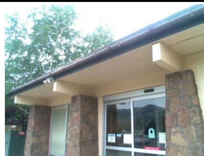
E Primary Structural Type wood beams