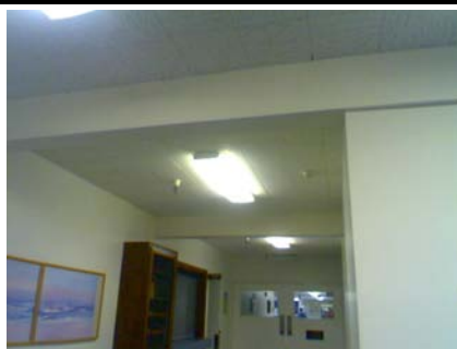
S Primary Structural Type looks like wood beams inside