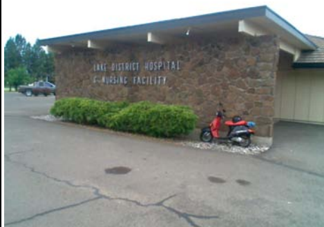
W General Site