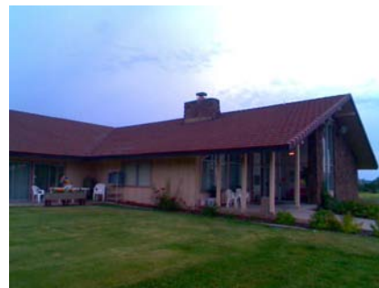
N General Site