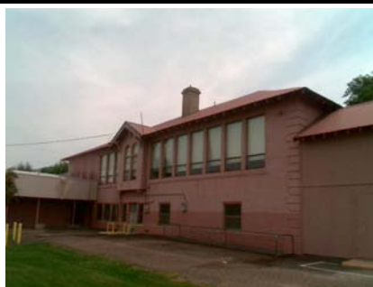
W Elevation View