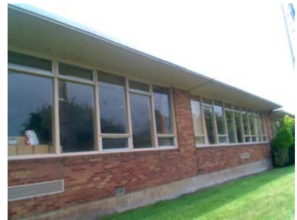
N Primary Structural Type