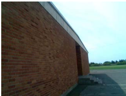
W Elevation View