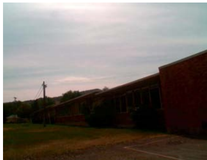
N Elevation View