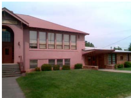
E General Site