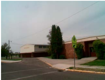
E General Site