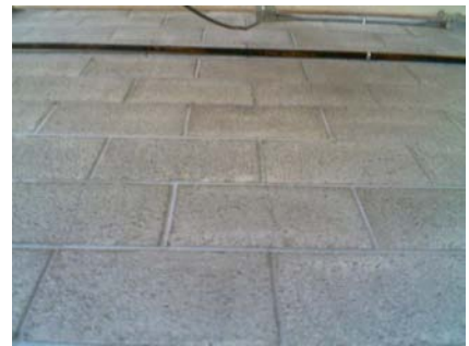
S Poor Condition Cracked RM wall, fire official claimed it was from a past earthquake.