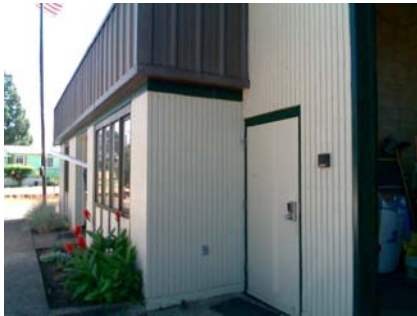
N Plan Irregularity Primary