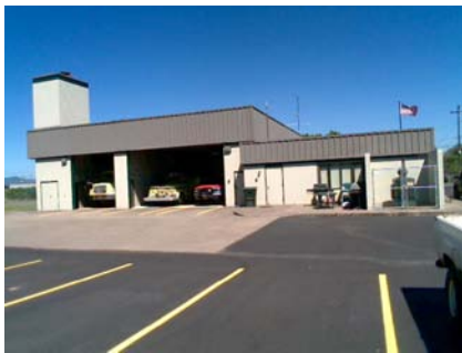
W Vertical Irregularity Primary