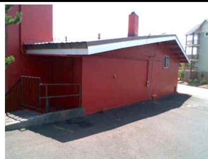
NW Vertical Irregularity Primary sloped site (minor). Reentrant corner also.