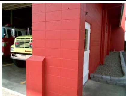
E Primary Structural Type