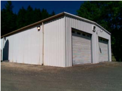
SW Primary Structural Type