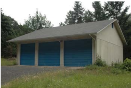
SW Primary Structural Type